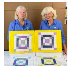
Link to YouTube