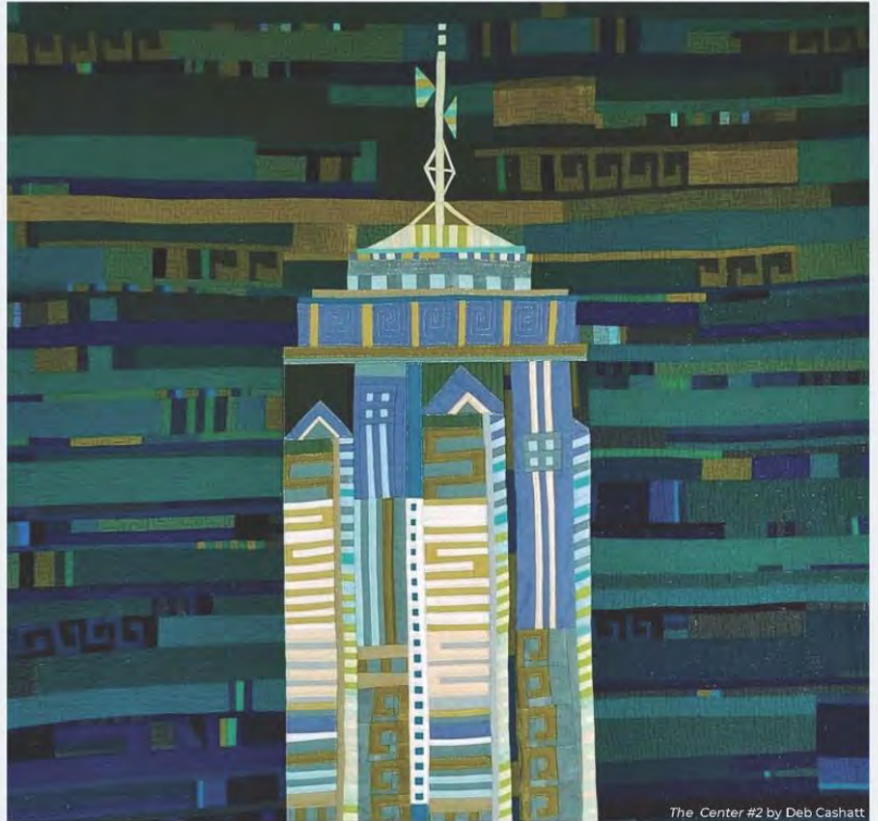
The Center #2 by Deb Cashatt