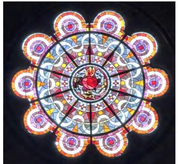
Figure 1 Front Window of The Sacre Coeur, Paris

See Charlotte Carpentier (email and phone in the roster.)