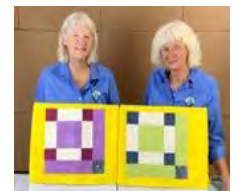
Link to YouTube