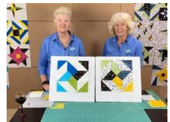
Link to YouTube Video