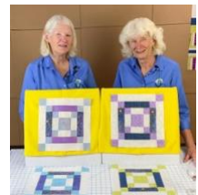
Link to YouTube