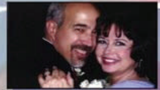
U.S. Marines, Retired