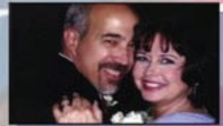
U.S. Marines, Retired